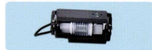
Waterproof loadcell protected