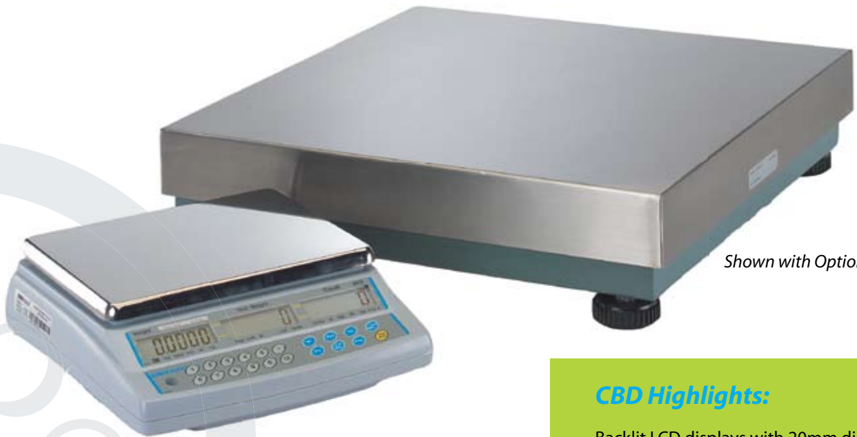
Shown with Optional Base

The CBD offers powerful counting processing in a simple to use and set up scale.